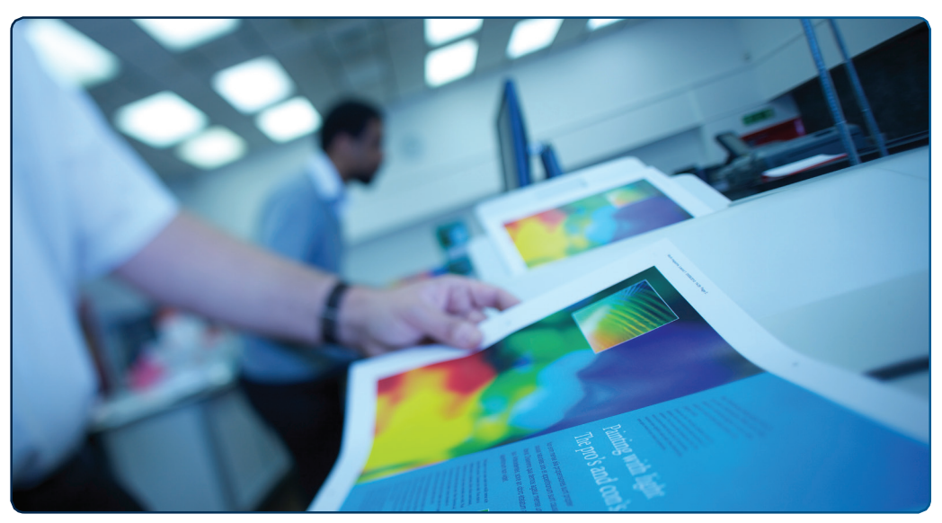
Supports digital, offset and large format fulfilment

After implementing Avanti Slingshot, Print Service Providers have found they can run with fewer resources, significantly improving their bottom line. Through Avanti Slingshot they can automate the management of all jobs and reduce touch points and manual intervention. It frees up sales and management time to focus on the top line and better serve clients and so improve profitability.